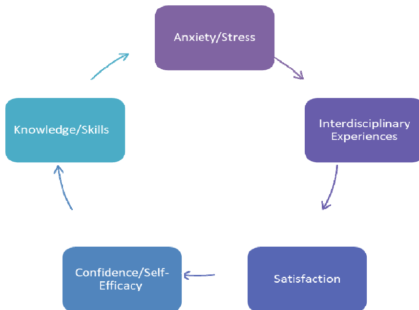
Figure 1: Simulation Assessment Themes (Foronda et al., 2013).