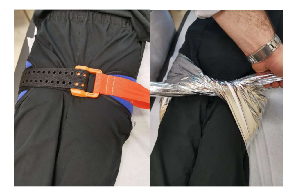
Figures 3 & 4: Application of SAM Splint and Pelvic Foil subsequently.