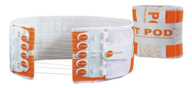
Figure 6 & 7: SAM Splint & T-POD devices.